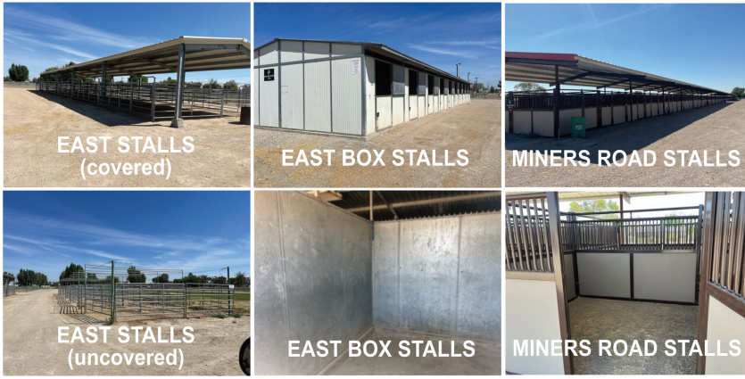
EAST STALLS (covered)